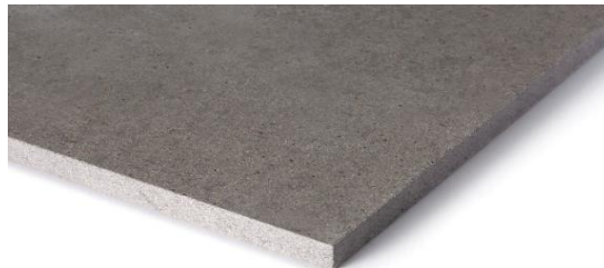
Swisspearl Windstopper Extreme (Dark grey)