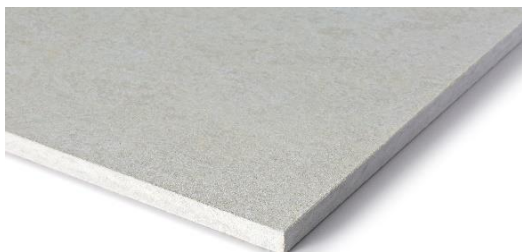
Swisspearl Windstopper Extreme (Natural grey)