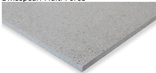
Swisspearl Multi Force