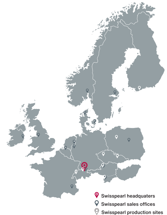
Figure 2. Swisspearl headquarters, sales offices and productions sites

In addition, to complete the portfolio Swisspearl buys and resells construction products from other manufacturers, e.g. fixing systems. All in all, Swisspearl with its' sales entities and factories form a strong manufacturing and sales network, figure 2.