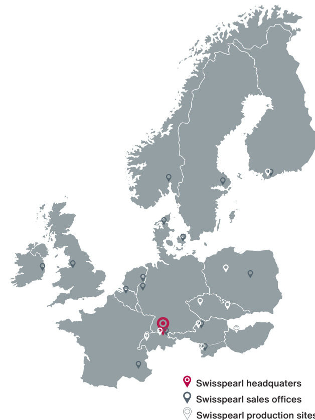
Figure 2. Swisspearl headquarters, sales offices and production sites

In addition, to complete the portfolio Swisspearl buys and resells construction products from other manufacturers, e.g. fixing systems. All in all, Swisspearl with its sales entities and factories forms a strong manufacturing and sales network, figure 2.