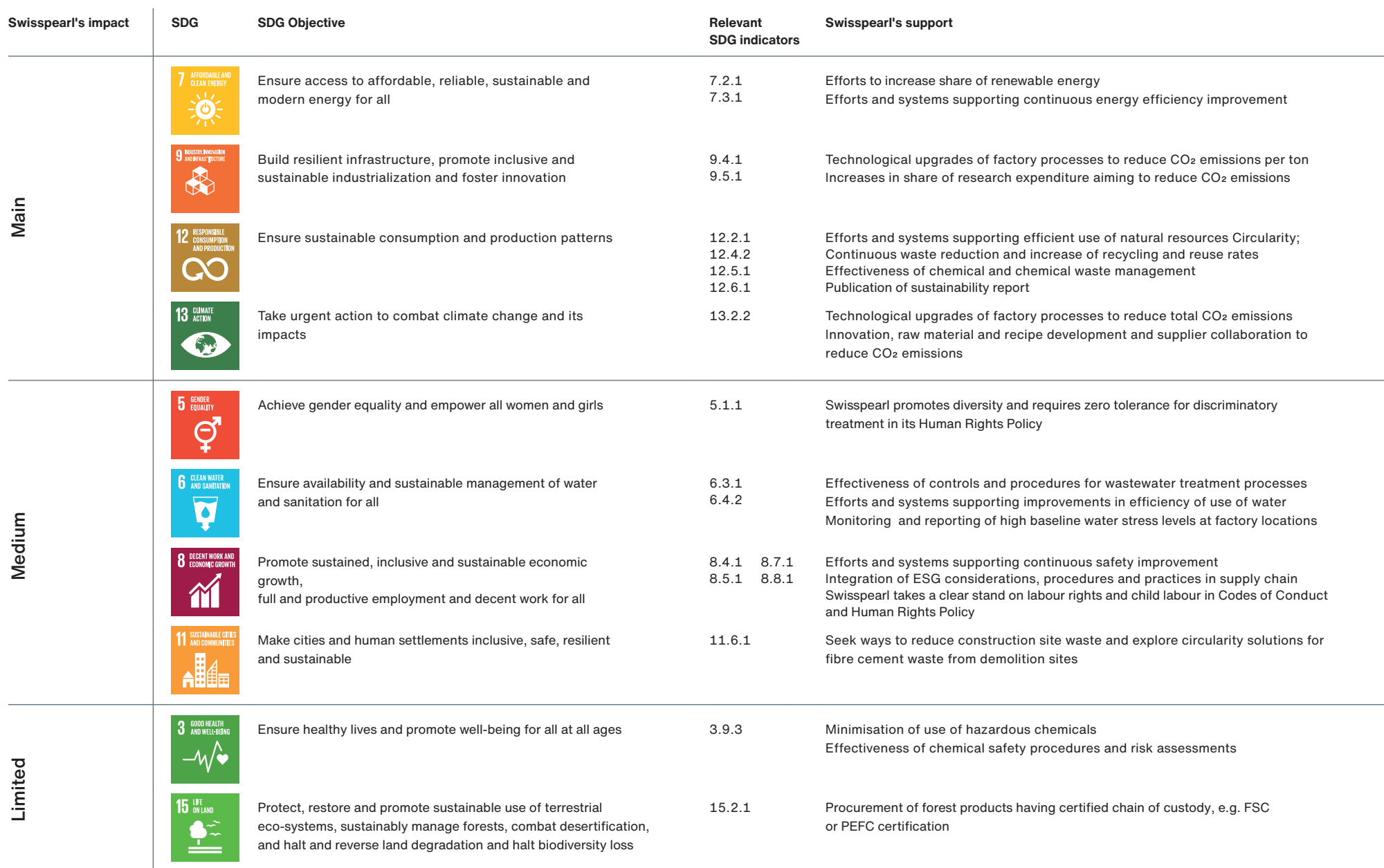
Figure 2. Cembrit and the UN Sustainable Development Goals.