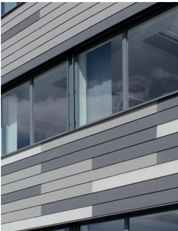
Siemens Headquarter, Kv Dalen, Finspång, Sverige LEED rating: Gold